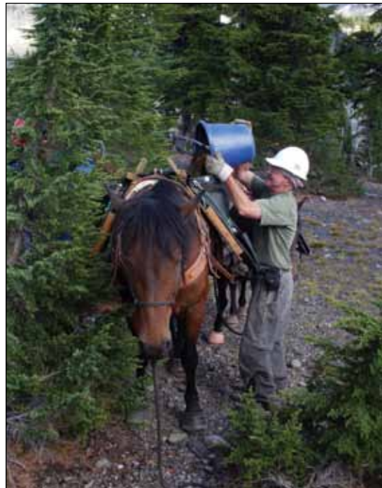
PCTA's ARRA-funded Windigo Trail Crew moved 8,400 pounds of dirt and rock to fill in eroded tread beside Sister Spring in the Willamette National Forest.