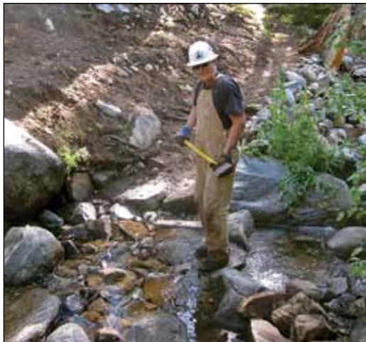
Volunteers from the Sacramento area journeyed to the Tahoe National Forest for several projects in 2010. Above: Fixing the hazardous Bear Lake Outlet. Right: Repairing the Haypress Bridge.