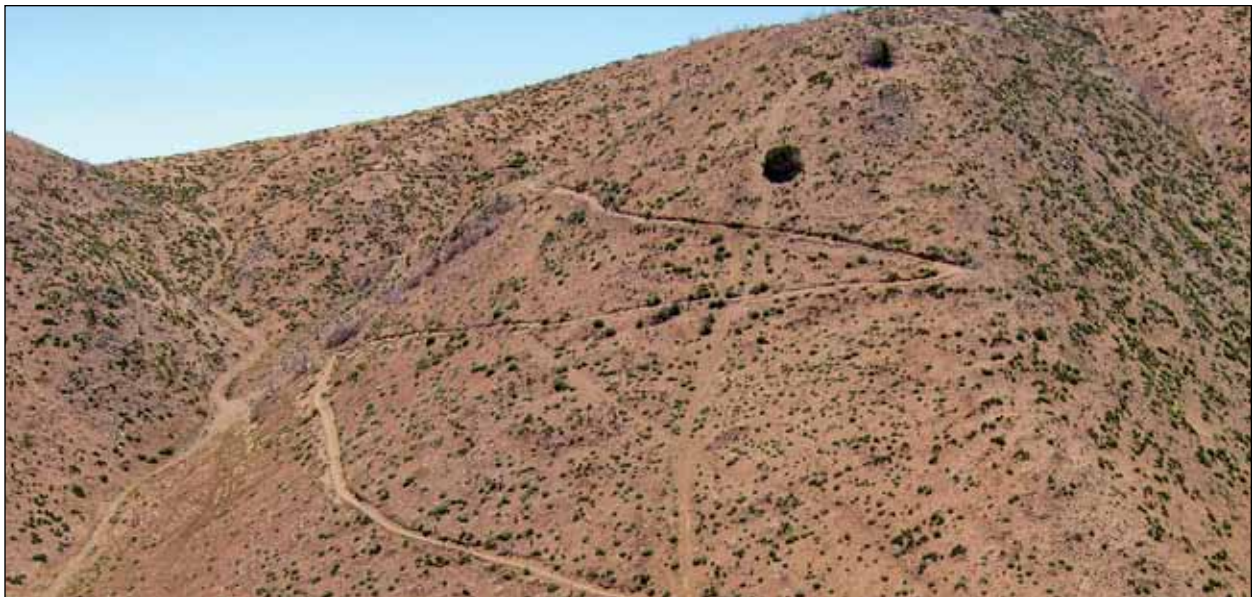
OHV trails crisscross and threaten user safety on the PCNST as it switchbacks north out of Gamble Spring Canyon in Southern California.

For more than two years, a task force – including the USFS PCNST Manager, BLM staff, PCTA staff, the Kern County Sheriff's Department and Supervisors Office, local community members