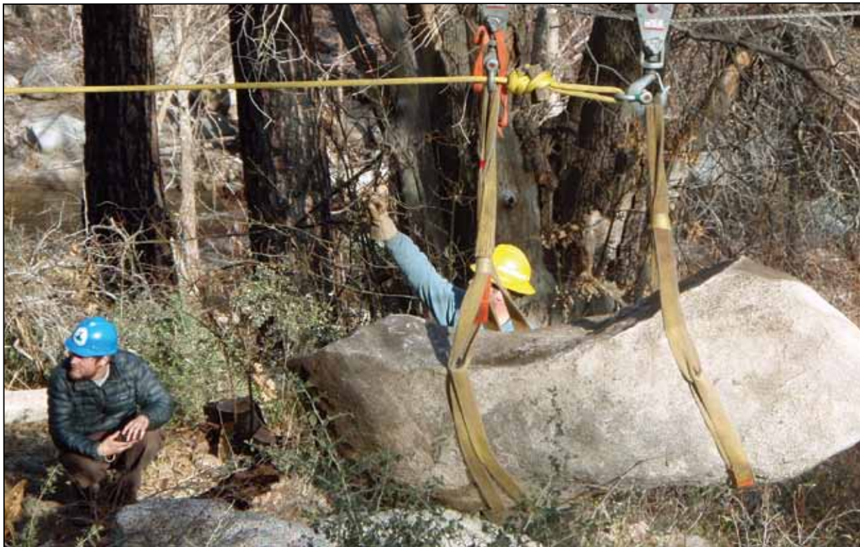
PCTA ARRA-funded staff Sam Commarto (left) oversaw technical rigging work performed by the Student Conservation Corps on the San Bernardino National Forest. ARRA funding supported 88 weeks of Student Conservation Association work on the PCNST in 2010.

PCTA continues to expand and update courses in its popular Trail Skills College Curriculum for training volunteers. New courses added in 2010 included trail re-construction, advanced crew leadership, drainage crossings, trail decommissioning, and signage. These courses are available for free download online and received positive feedback from trail organizations across the country.