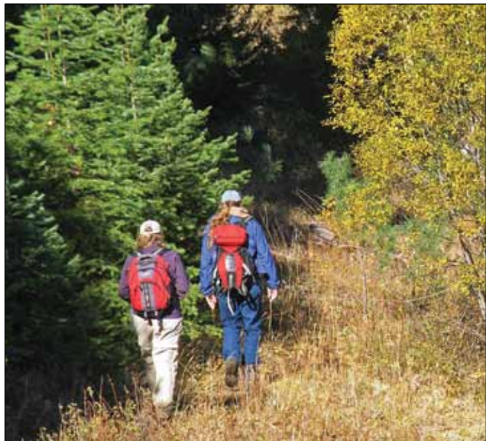
In 2010, the PCTA celebrated the completion of the "First Mile" campaign by purchasing a conservation easement to protect 0.94 miles of the PCNST.

The PCTA completed the "First Mile" campaign in 2010 by purchasing a landmark conservation easement. This is the first-ever PCTA-led land acquisition project to protect the legacy of the PCNST along Keene Creek, in Southern Oregon. A 150-acre property contains 0.94 miles of the PCT within the Cascade Siskiyou National Monument. The PCTA partnered with the Pacific Forest Trust and the BLM to acquire a conservation easement on the property which permanently protects the PCNST. As part of the agreement, the Pacific Forest Trust provided technical expertise and the PCTA raised $300,000 to cover the cost of purchasing the conservation easement and other expenses.