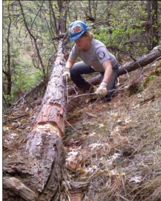
Four Northwest Service Academy AmeriCorps crews worked on the PCNST. This crew on the Lassen National Forest installed 12 feet of turnpike and 40 feet of log cribbing.

The Student Conservation Association is a nonprofit organization that offers conservation internships and trail crew opportunities to high school- and college-age volunteers from diverse backgrounds. In 2010, four six-person trail crews devoted more than 14,000 hours of work to the PCNST.