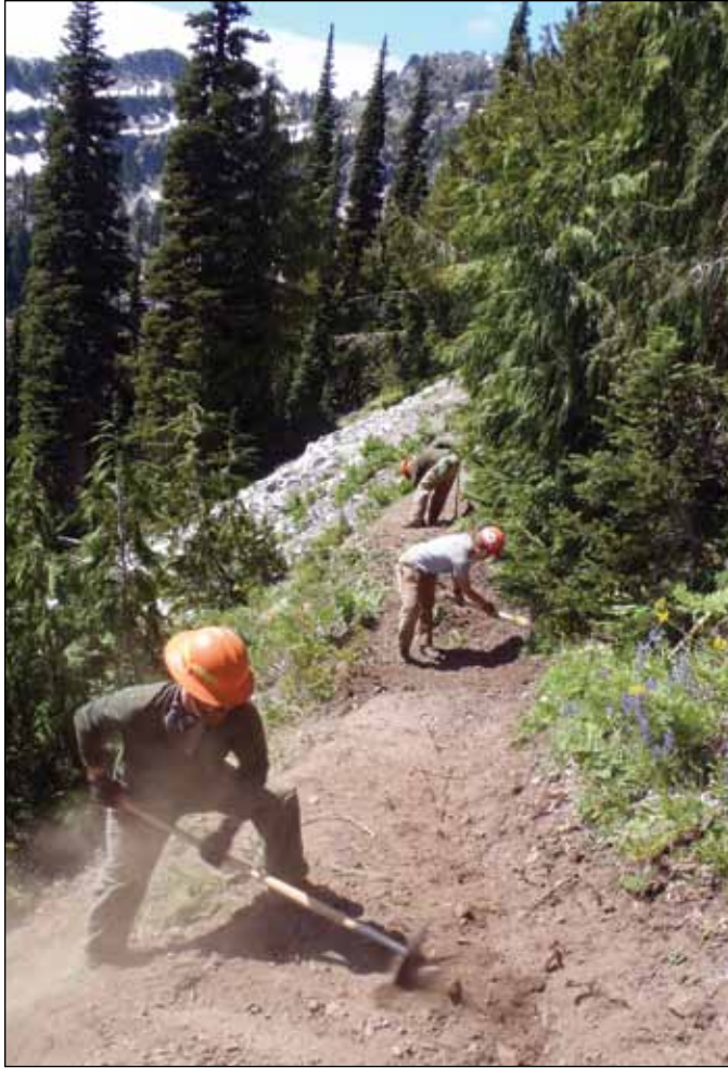
Four Northwest Service Academy AmeriCorps crews worked on the PCT in 2011. This crew reconstructed 3,750 feet of trail tread in the Okanogan-Wenatchee National Forests.

14 NWSA crew leaders spent six weeks in trail skills training. During the training, PCTA staff rotated to teach leadership skills to new team leaders as well as how to recognize and repair trail problems. The training concluded with the team leaders hosting a weekend volunteer project with the Environmental Charter High School students under the supervision of PCTA staff. This is a great example of how the PCTA's volunteer program leverages the NWSA and Student Conservation Association corps crews. These technically-trained crews provide training in trail crew leadership and advanced trail construction techniques as well as hands-on guidance to local volunteers. Throughout the summer and fall of 2011, 126 volunteers accompanied these AmeriCorps crews.