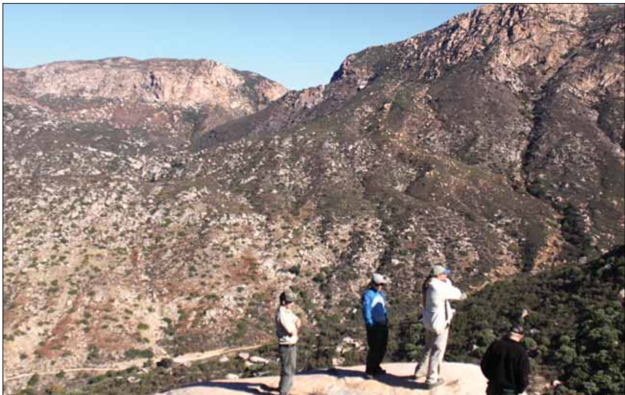
Working with the BLM using “all-lands” management, staff from the PCTA and Cleveland National Forest look for possible new locations for the PCT descending into Southern California’s Hauser Canyon.

Relocation of the Trail, which will soon be under the power line, is possible. SDG&E supports moving the PCT onto Cleveland National Forest lands. Prior to moving the section of Trail, PCTA, BLM, and the Forest decided to conduct an Optimal Location Review to ensure the Trail is relocated to the most optimal location. To complete the Optimal Location Review process, the PCTA and partnering agency staffs are analyzing the first 28 miles of PCT, from the southern terminus on the Mexican Border to its crossing under Interstate 8. This is the first step in a multi-year project. Additional field surveys, designing and flagging of the final route, and an Environmental Assessment must be completed before new trail construction will begin.