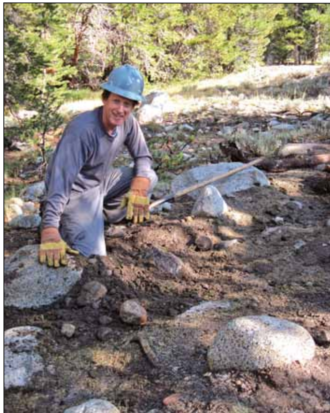
In 2011, 115,400 volunteer and corps crew hours were contributed to maintenance of the PCT.

Each year the PCTA works hard to provide meaningful and rewarding citizen stewardship opportunities that connect American communities with the great outdoors. We also offer quality training programs to enrich the safety and trail skills of these stewards.