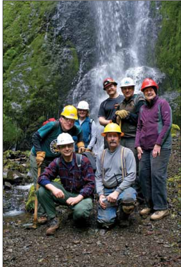
In 2011, dedicated section caretakers and volunteers from PCTA's Mount Hood Chapter contributed 5,767 hours to maintain their 221 miles of the PCT.

These comments are equally important but it is the last one that has become an increasing concern. Population is growing exponentially in the United States and, according to the U.S. Department of Transportation, more than 80% of Americans live in urban areas. It's no wonder that an increasing number of