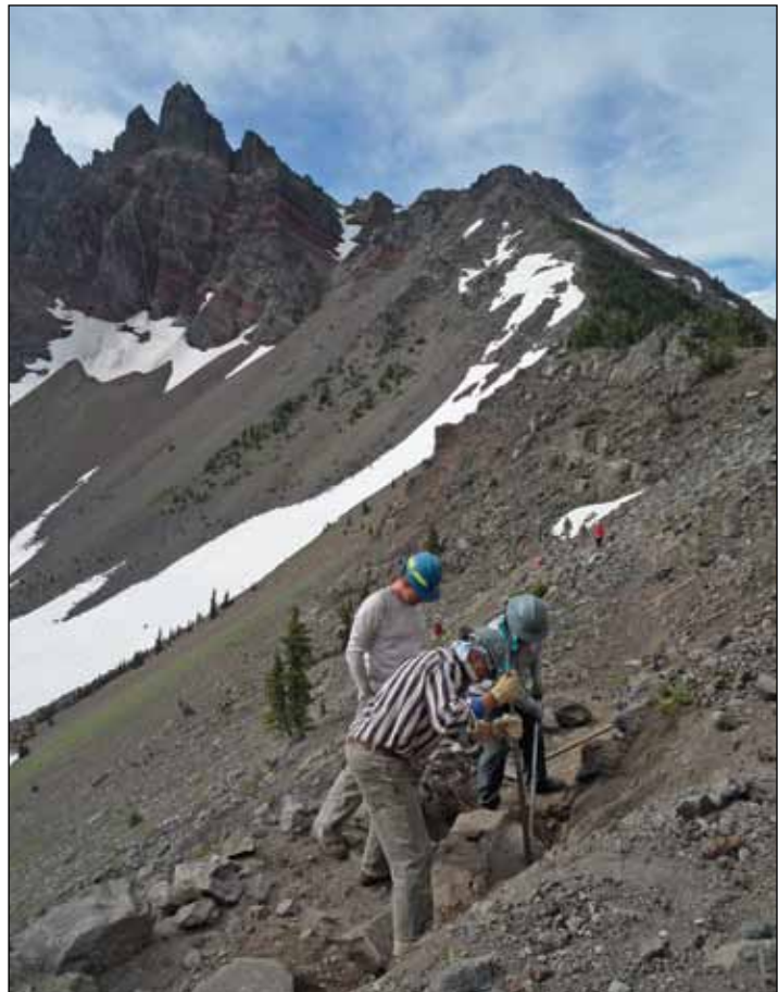
This 10-member PCTA Windigo-Skyline Trail Crew volunteered 495 hours on a five-day project building three rock walls on the Willamette National Forest.

Two outdoor recreation retailers partnered with PCTA, sending volunteers as a way to better their local communities. Twenty staff members from Outdoor Research volunteered 163 hours working with PCTA's North 350 Blades to remove encroaching vegetation and restore drainage on more than a mile of the PCT. Seven staff members from Eugene, Oregon's REI store participated on a PCTA Windigo Trail Crew. They volunteered 148 hours to complete heavy trail reconstruction on two miles of the PCT that had been subject to storm damage.