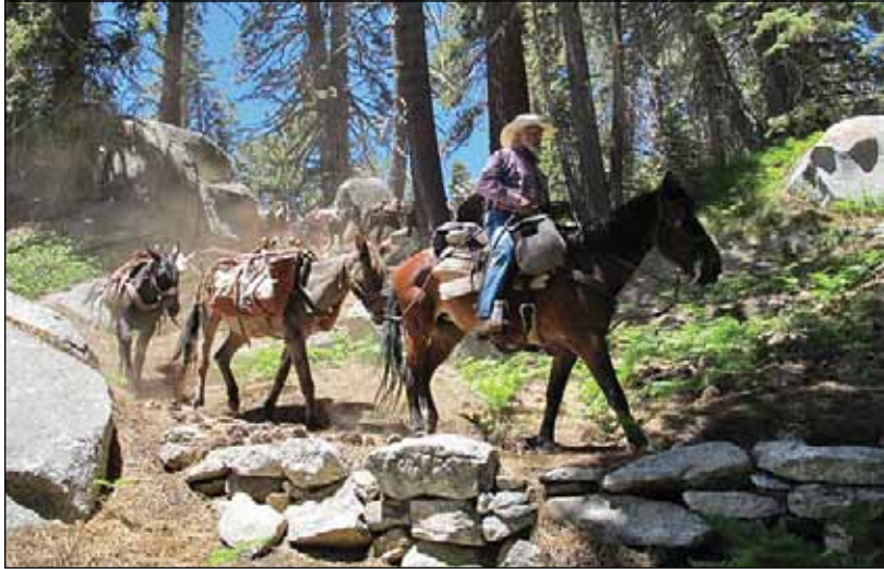
A California Conservation Corps youth crew devoted 5,295 volunteer hours to the PCT in California's Mt. San Jacinto State Park on Fuller Ridge. The PCTA took the lead role coordinating volunteer packers from the Backcountry Horsemen of California. Contributing more than 1,100 hours, the pack teams moved more than 8,000 pounds of gear, tools, food, and supplies seven miles to the California Conservation Corps base camp for this project.