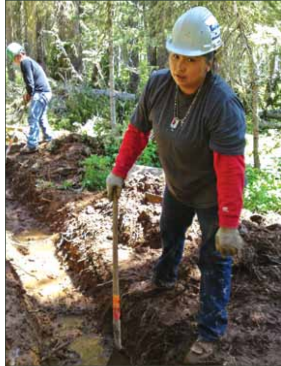
For the second year, Warm Springs tribal crew members worked with PCTA and Forest Service staff in Oregon to receive on-the-job training in first aid, food handling, Leave No Trace wilderness ethics, and trail skills. For many crew members, it was their first job, through which they learned important job skills.

The Northwest Service Academy AmeriCorps (NWSA) is a nonprofit that acts as a training and operational center for the AmeriCorps program. They continued to be a strong partner for the PCTA in 2011. Four NWSA AmeriCorps teams traveled along the Trail for five months. To start the season,