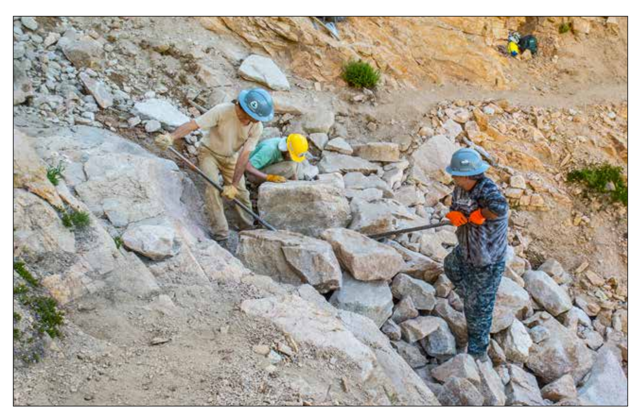
The foundation of PCTA's volunteer programs includes 12 community-based volunteer groups dispersed along the Trail. These groups tend to designated stretches of the PCT by working with PCTA staff and local agency partners in all trail maintenance efforts. Major metropolitan areas provide a solid foundation of committed volunteers and novices for these groups, and each season they are joined by volunteers from across the country and around the world.