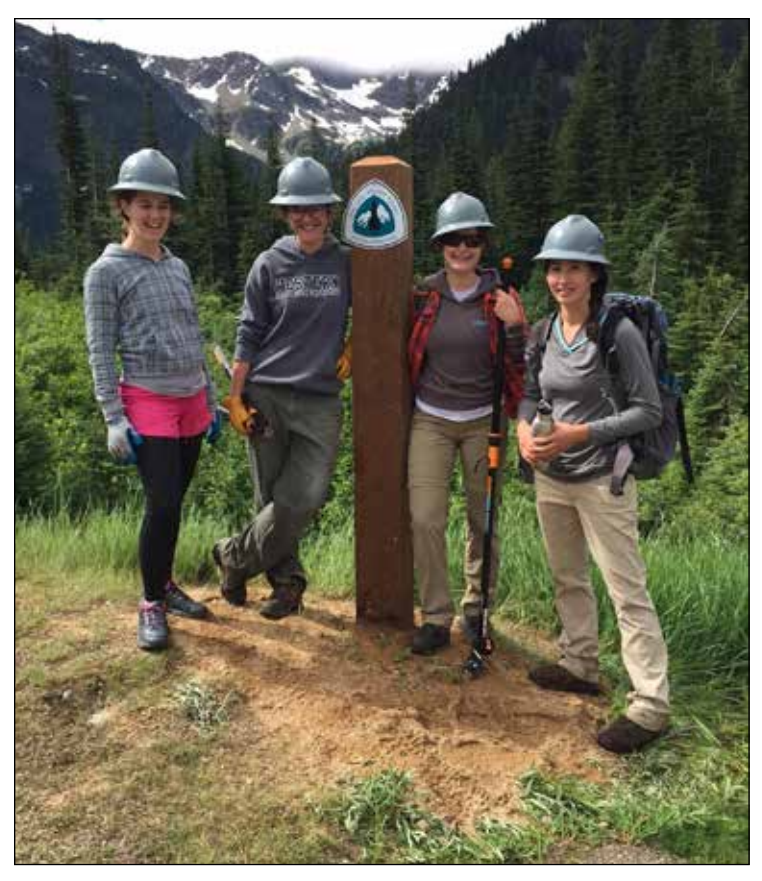
PCTA and its partners engage volunteers as citizen stewards to help keep the PCT safe and passable for users. In 2016, 2,081 citizen stewards and corps crew members contributed 104,269 service hours, an inkind value of $2.46 million. Near Washington's North Cascades National Park, volunteers replaced signs to help hikers and equestrians find the Trail.

In 2016, the PCTA began working with Washington's North Cascades National Park. The strategic partnership started with the development of a formal Volunteer Service Agreement early in the year. This agreement not only provided the foundation for the partnership, but it