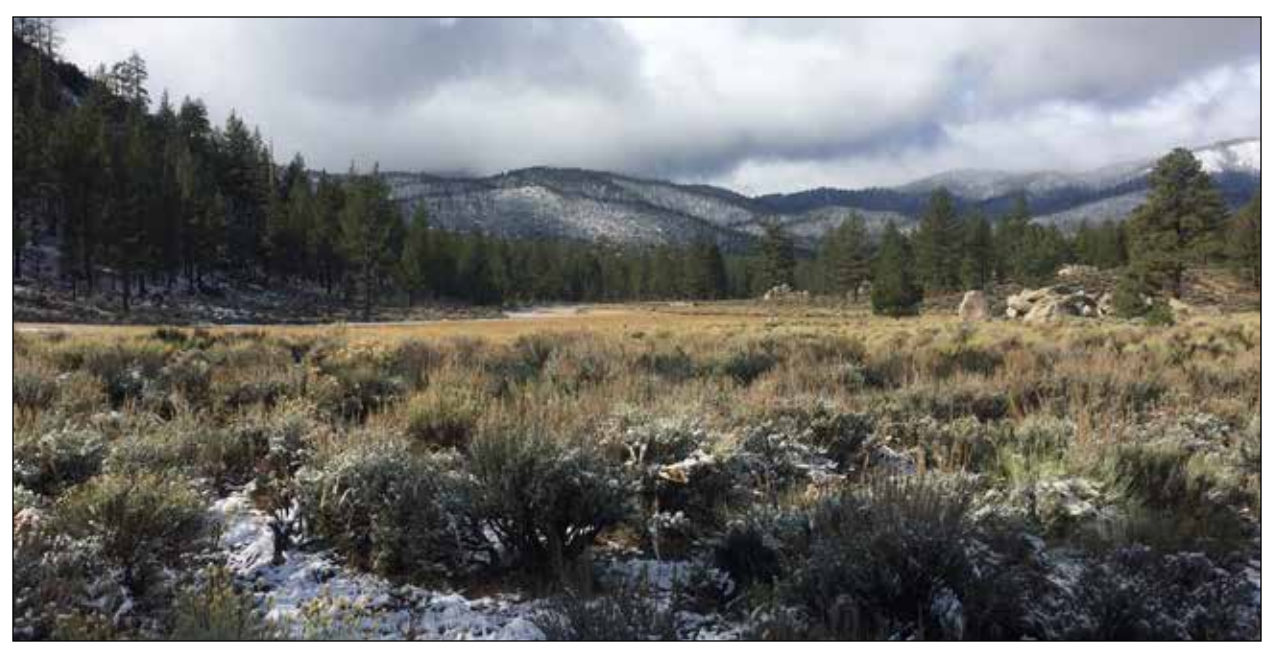
In 2016, the PCTA pre-acquired the 245-acre Landers Meadow property in the southern Sierra in Kern County, California. This property protects scenic viewshed and high elevation meadows along the PCT that provide critical habitat for birds, bears, mountain lions, deer, and elk.

In Washington, the USFS acquired 1,164 acres from The Nature Conservancy to permanently protect the PCT corridor on the Mount Baker-Snoqualmie and Okanogan-Wenatchee National Forests. The PCT community has been working for more than a decade to help consolidate the checkerboard parcels owned by Plum Creek Timber Co. along the Pacific Crest Trail. Since 2001, more than 10,000 acres have been acquired within this checkerboard to protect the PCT trail corridor. This ongoing effort to consolidate public ownership has helped to connect fragmented forest, provides safe migration corridors for wildlife, increases public access to the National Forest lands and permanently protects the experience and scenery for hikers along the PCT. The USFS also