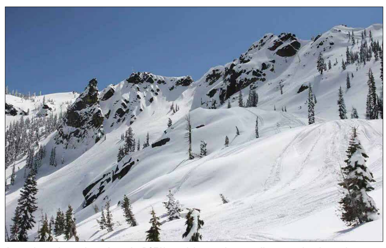
A prominent theme throughout the PCTA's work is ensuring a quality recreational experience for PCT users. The PCTA tracks and works to influence planning efforts that affect the Trail. In 2016, the Stanislaus, Eldorado, Tahoe, Plumas and Lassen National Forests' Travel Management Subpart C Over-snow Vehicle (OSV) Use projects were the focus of these efforts.

However, work to sustain and enhance outdoor recreation opportunities on the PCT goes beyond just digging in the dirt to maintain the Trail.