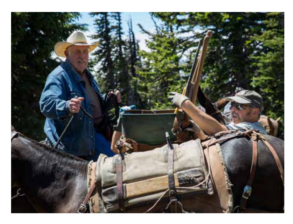
Some say mules built the West. They definitely built the PCT. Leveraging strategic partnerships with packers, stock support, and equestrian volunteers is integral to the successful maintenance and restoration of the PCT.

crucial in Northern Washington, where the Trail sees heavy snowfall in the winter, runoff in spring and regular equestrian traffic in the summer. The collaborative spirit amongst the partners epitomizes the spirit of the partnership along the entire PCT.