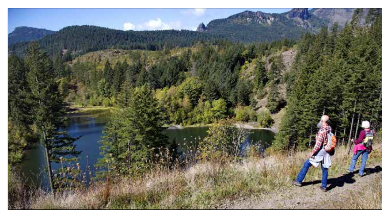
The USFS acquired 273 acres in the Columbia River Gorge National Scenic Area, protecting a mile of the PCT and securing public access to Gillette Lake in Washington. Land acquisition along the PCT is vitally important to conserving large landscapes and sustaining the natural recreation experience on the Trail. There are 1,500 parcels that include or are adjacent to the PCT that have been identified as crucial to preserving both the Trail and the high-standard experience people have come to expect while using it.

acquired 273 acres in the Columbia River Gorge National Scenic Area, protecting a mile of the PCT and securing public access to Gillette Lake, which is a popular destination for Boy Scout troops, families, and PCT thru-hikers from around the world.