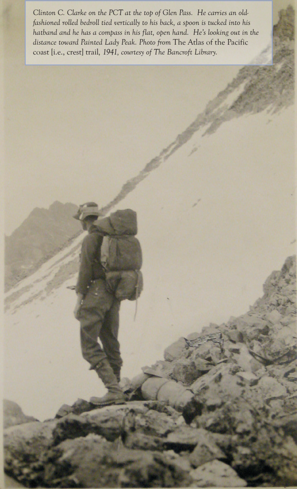
Summit of Glenn Pass