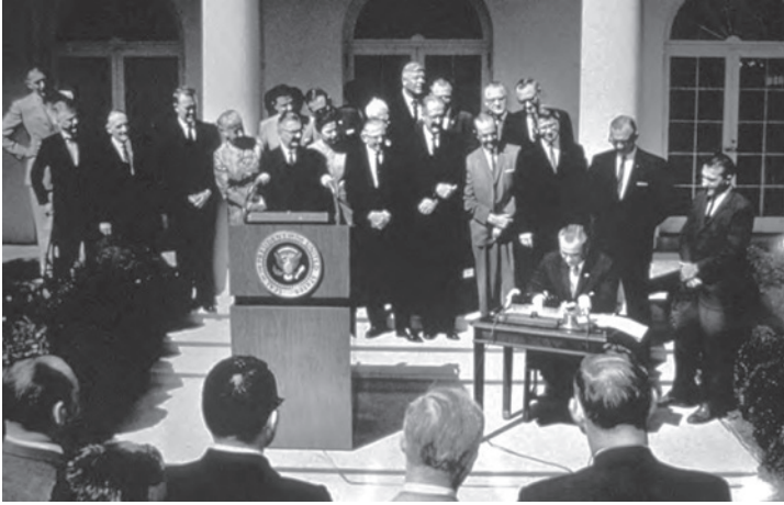
President Lyndon Johnson signs the Wilderness Act into law.

action by the Secretary of Agriculture to remove the designation or alter boundaries (which did occur in 1940).