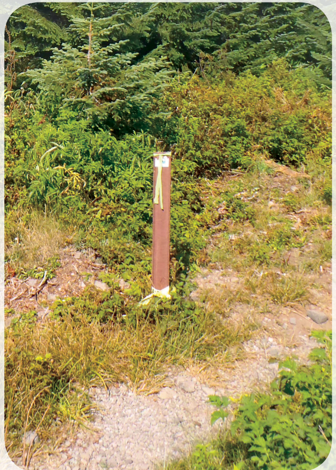
The Pyramid Peak property that is shown on the map, being held in trust for the USFS by the Trust for Public Land.

Volunteers from the Washington Trails Association have also reconstructed a lot of tread in this area. All of the hard work is beginning to show, and the trail is in great shape. More needs to be done, and you can help. To learn more about the North 350 Blades, join their mailing list by sending an email to north350blades@gmail.com or find them on Facebook. 🐦