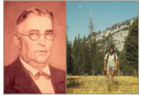
Clinton Clarke, PCTA visionary

The Pacific Crest Trail Association is dedicated to and intertwined with the Pacific Crest National Scenic Trail. In the 1930's, Clinton Clarke, a civic leader, had a vision of a path traveling the length of the crest of the great Pacific mountains. Clarke's vision inspired scores of young volunteers, who mapped the route in the late 30's. Local groups organized to maintain and promote the Trail and coalesced to eventually form the Pacific Crest Trail Association (PCTA). The PCTA officially incorporated in 1977 and continues to grow and evolve. The world has changed since 1932, but the Pacific Crest Trail Association remains inspired by Clarke's vision of opportunity and freedom.