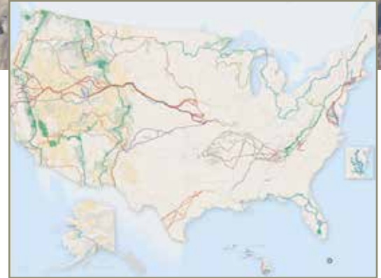
America's National Trails System

The PCT enjoys great company. Beginning with the National Trails System Act in 1968, Congress has designated eleven National Scenic Trails. Some, like the Appalachian Trail, are world renowned, and receive heavy use. Others, like the new Pacific Northwest Trail, are lonely, undiscovered treasures. Together, National Scenic Trails comprise more than 17,000 miles of inspiring, challenging, uniquely American experiences.