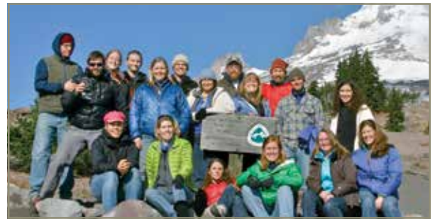
PCTA staff in the field

The Pacific Crest Trail Association is headquartered in Sacramento, California, with regional staff in strategic locations along the length of the Trail. The PCTA works with 25 regional affiliated and partner groups to coordinate maintenance, improvement, and volunteer projects. We're a nonprofit charitable organization ~ supported by members, volunteers, and hikers ~ who make the Pacific Crest Trail experience possible.