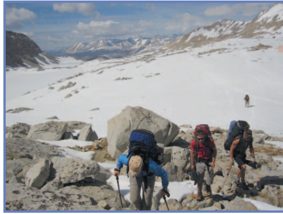
Cleary and crew ascend Forester Pass to get some extreme footage.

For schedule information, go to http://channel.nationalgeographic.com/channel and click the NATGEOTV tab.