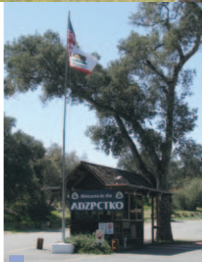
Above: The class of 2010. Right, top: ADZPCTKO volunteers take time off from their chores to pose for a group shot. Right, bottom: What Kick Off is all about: Hikers setting off on their journey. Left: ADZPCTKO attendees are welcomed at the entrance to Lake Morena County Park.