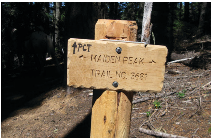
This page: A Sharpie pen mars a new sign in the Deschutes National Forest.

In the sign manual's illustration of standards using the Continental Divide Trail as an example, reassurance markers and directional guide signs with the national trail's name spelled out are used at the same junction. Some forests have been doing it this way all along. Others might not have read this part of the relatively new sign manual, or might believe that the PCT's plan trumps it. Either way, the Comprehensive Plan does allow directional guide signs to be placed along the trail "to meet the needs of the user and management," so there will always be a degree of local trail manager discretion involved.