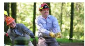
Trail Skills College