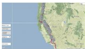
Find a project!