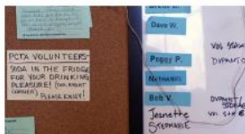
Office and events