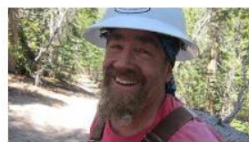
Join a Regional Group