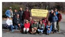
For new volunteers