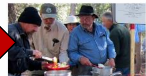
Crew leader center