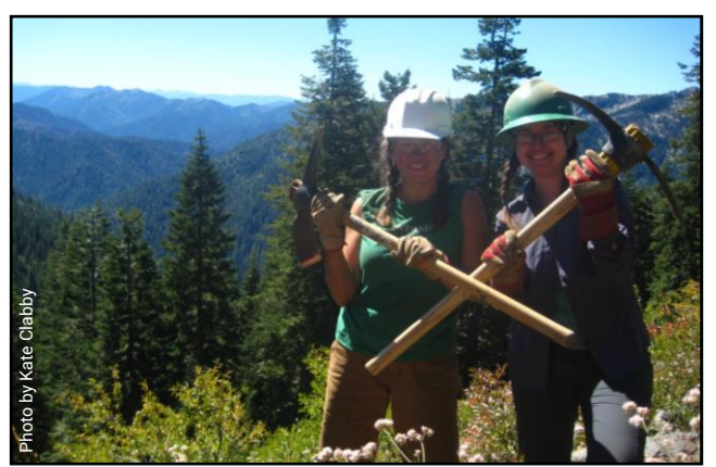
pitch in to help one another. Responsibilities are shared both on the trail and at the camp. Many times, teamwork is the only way to complete a task at hand.

Each trail crew is composed of a diverse group of people. They vary in age, gender, and ethnicity. Each crew member will have a different background, profession, and place they call home. Getting to know your fellow trail crew members can be fun and is an inevitable part of being on a trail crew. The crew size will typically consist of 3-12 individuals. Since the crew lives and works together throughout the duration of the project it is important that all crew members