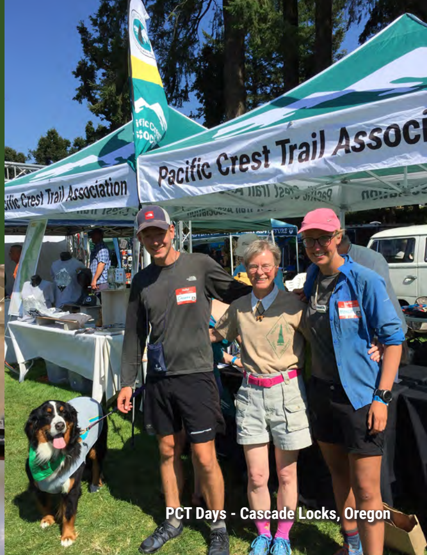
PCT Days - Cascade Locks, Oregon