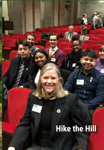
Hike the Hill

While your gifts funded our ongoing trail maintenance projects, they also benefited the trail in many other ways—some less visible but no less important.