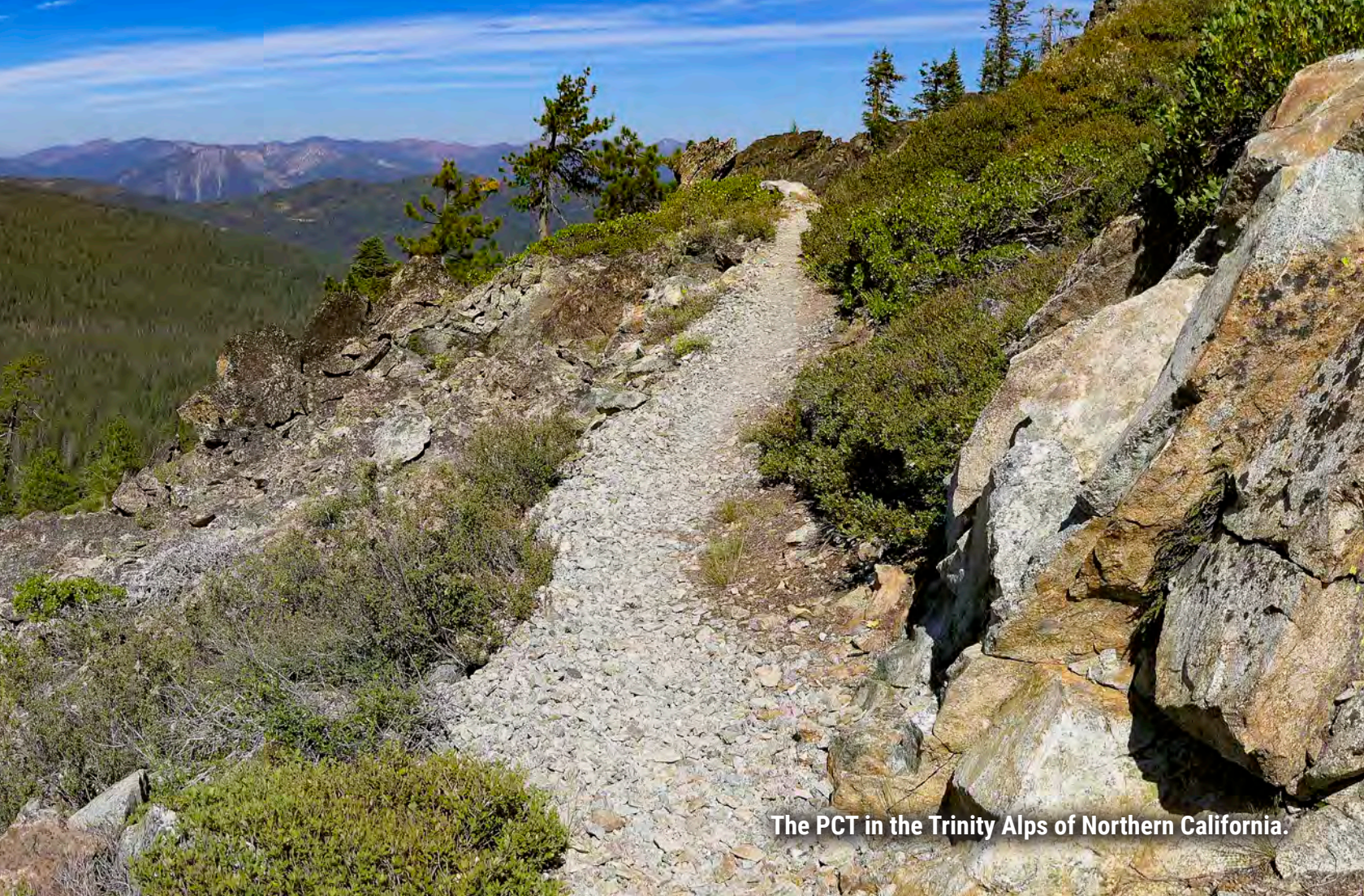
The PCT in the Trinity Alps of Northern California.