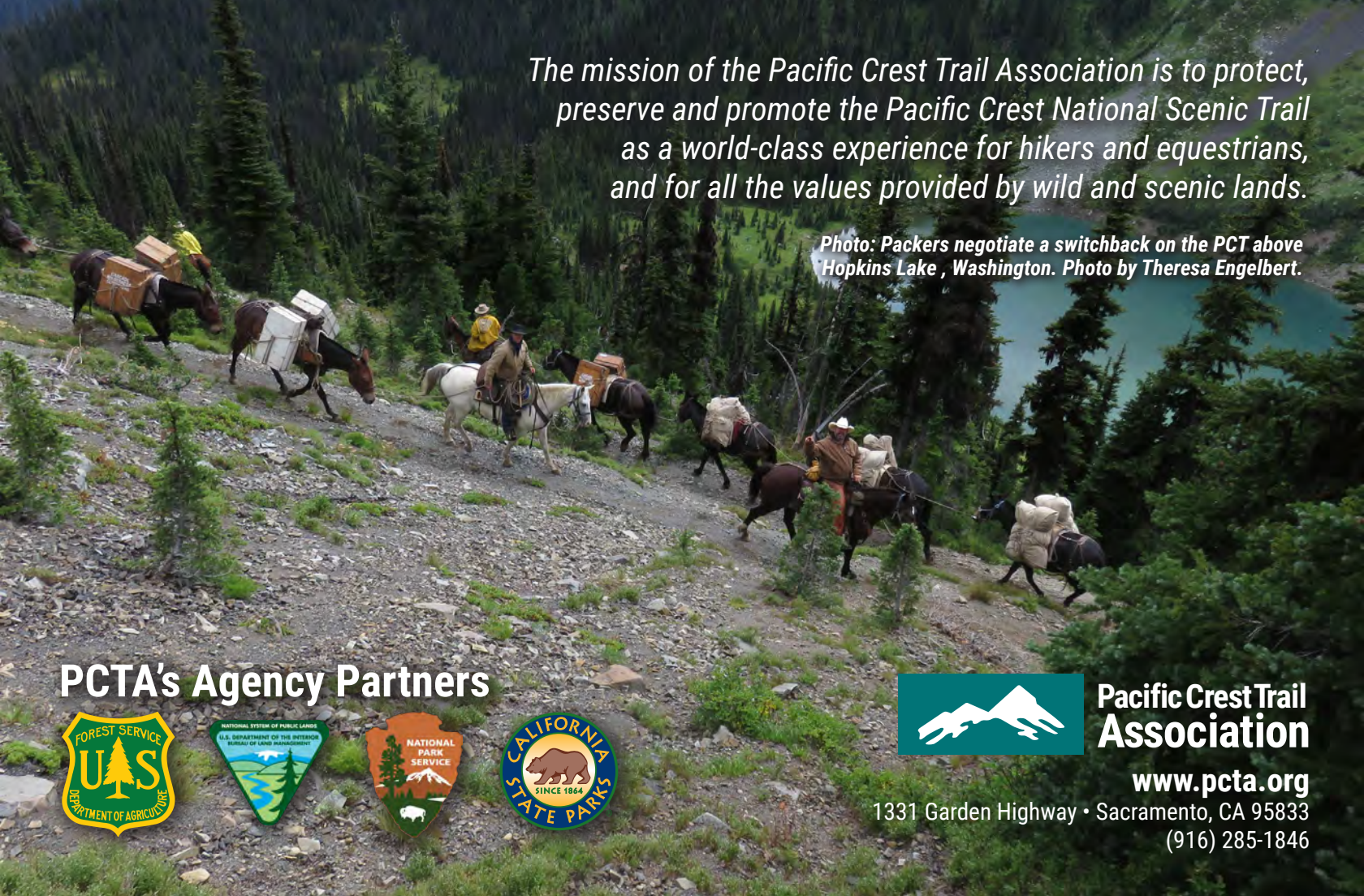
Photo: Packers negotiate a switchback on the PCT above Hopkins Lake , Washington.

The mission of the Pacific Crest Trail Association is to protect, preserve and promote the Pacific Crest National Scenic Trail as a world-class experience for hikers and equestrians, and for all the values provided by wild and scenic lands.