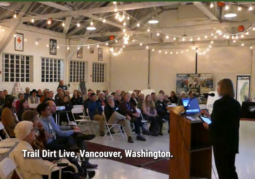
Trail Dirt Live, Vancouver, Washington.

protect land on the trail • meet with elected leaders to ask for trail funding • develop educational materials • train volunteers • work with agency partners to protect the trail experience • provide trail info at events • process permits...and more.