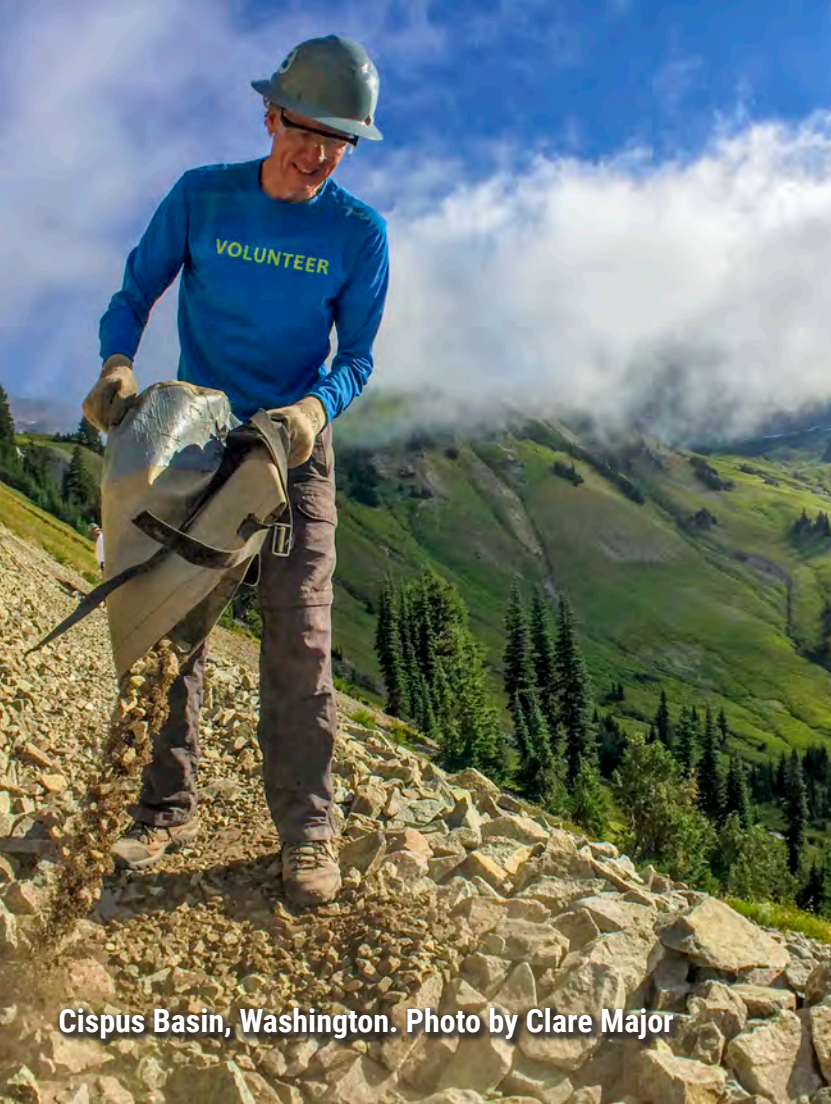
Cispus Basin, Washington.