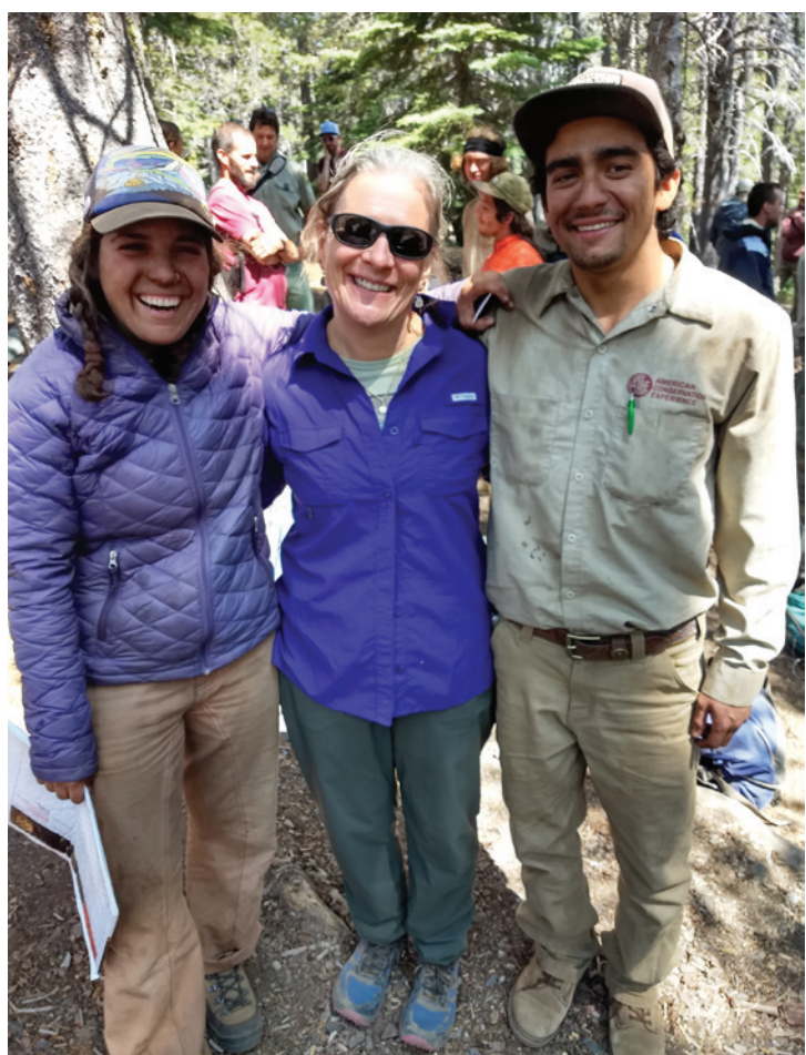
Decked in purple on a PCT hike (left), and with trail crew members (right) from the American Conservation Experience.

has been heard and is valued is second to none. And her ability to navigate challenging and stressful situations while instilling calm and assuredness that we will find common ground are all things that I admire and appreciate about her."