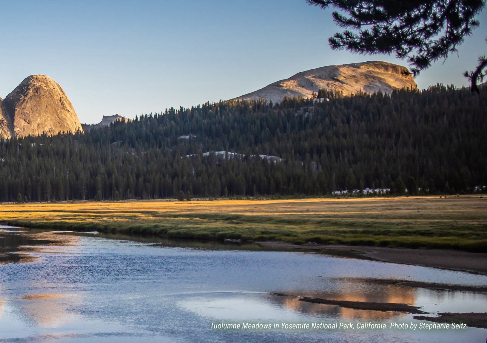
Tuolumne Meadows in Yosemite National Park, California.