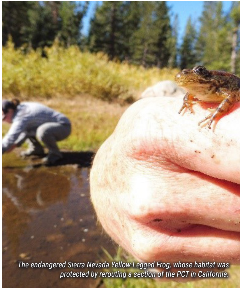
The endangered Sierra Nevada Yellow-Legged Frog, whose habitat was protected by rerouting a section of the PCT in California.

The work spanned a two-year period and included a footbridge that was built off-site to protect the habitat. PCTA and the Forest developed an interpretive kiosk , and in 2021 the bridge and reroute were completed with support from the American Conservation Experience (ACE) , an AmeriCorps program and major PCTA trail maintenance partner.