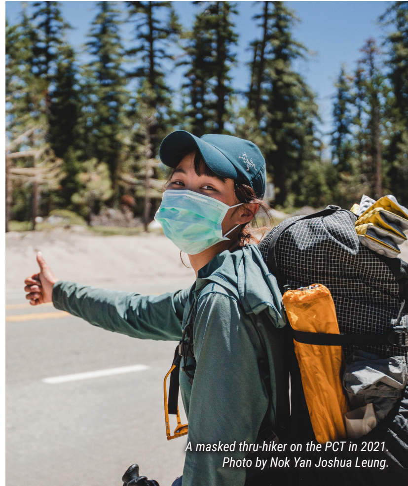
A masked thru-hiker on the PCT in 2021.

Covid-19 guidance for the PCT was posted on the PCTA website and frequently updated according to the latest federal and state guidelines.