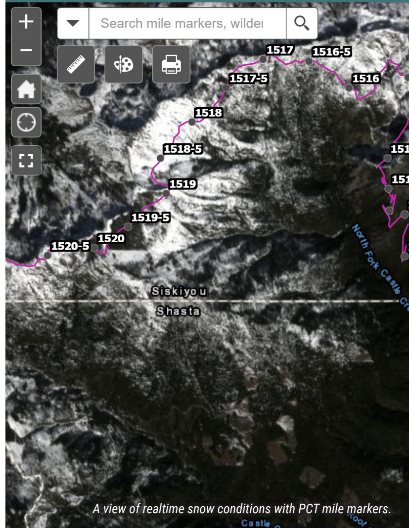
A view of realtime snow conditions with PCT mile markers.

To view the new map, go to pcta.org/maps on your computer, tablet or smartphone.