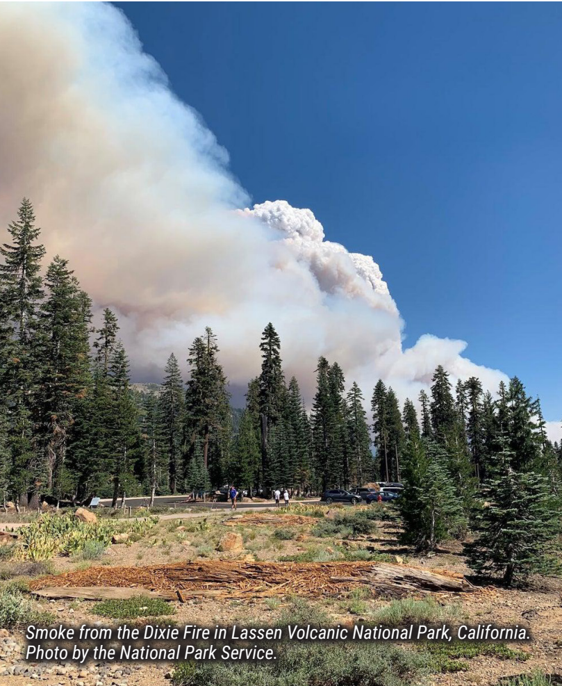
Smoke from the Dixie Fire in Lassen Volcanic National Park, California.

During the last two years, wildfires have reshaped Western landscapes with increased frequency and intensity . They are curtailing and preventing people's enjoyment of the PCT and public lands, dampening the already seasonal economies of trail towns and increasing the maintenance backlog on the trail