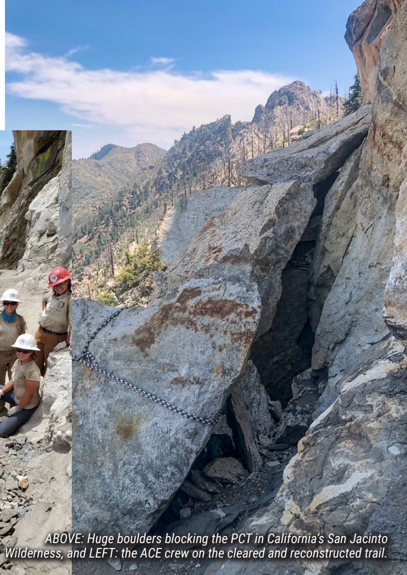
ABOVE: Huge boulders blocking the PCT in California's San Jacinto Wilderness, and LEFT: the ACE crew on the cleared and reconstructed trail.