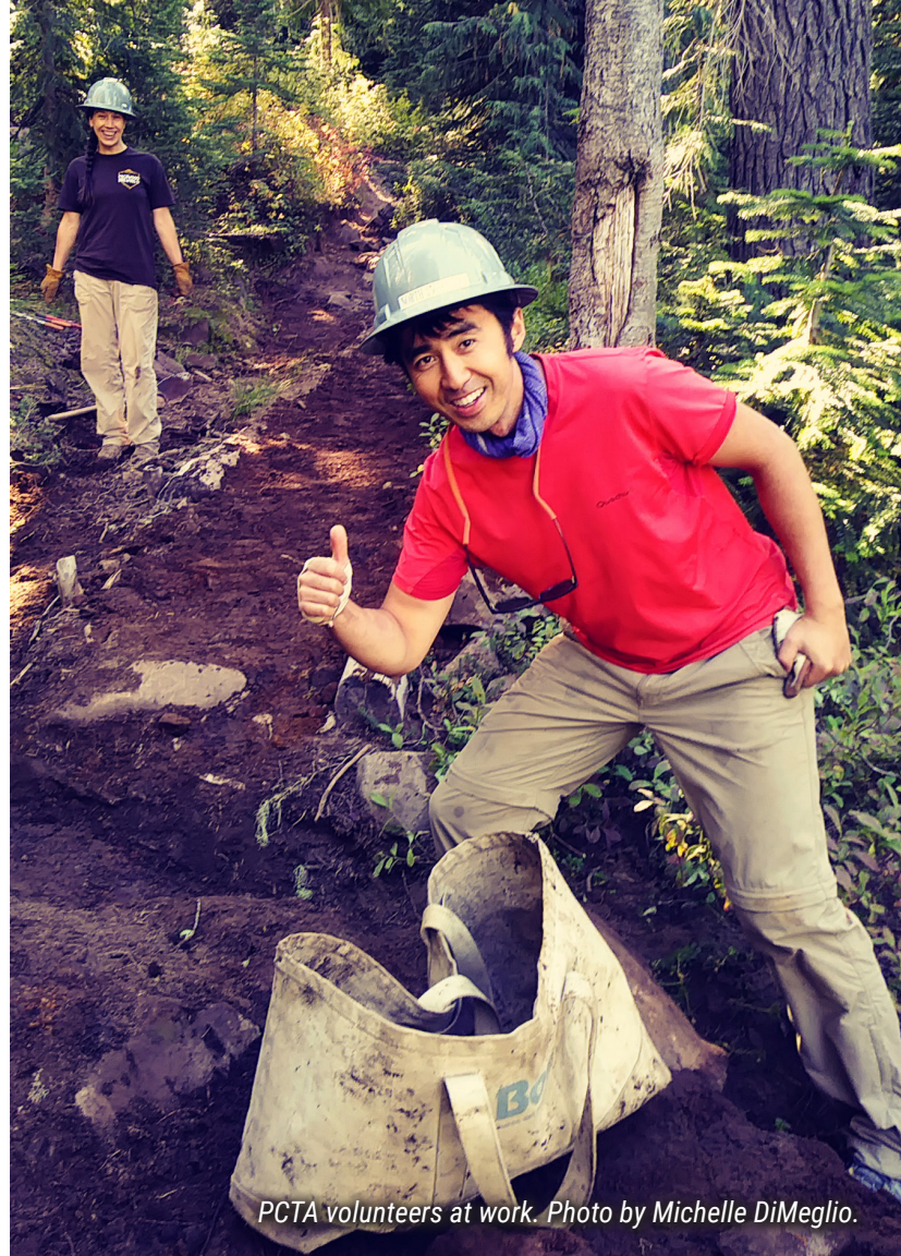
PCTA volunteers at work.