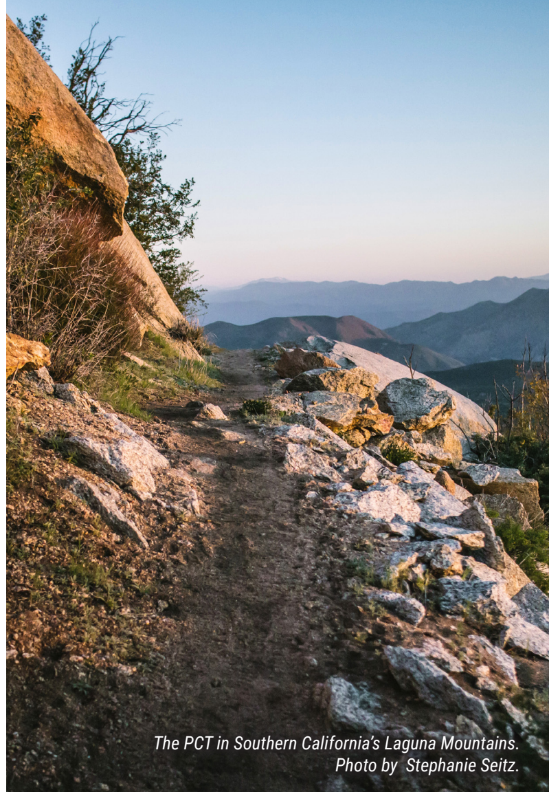
The PCT in Southern California's Laguna Mountains.