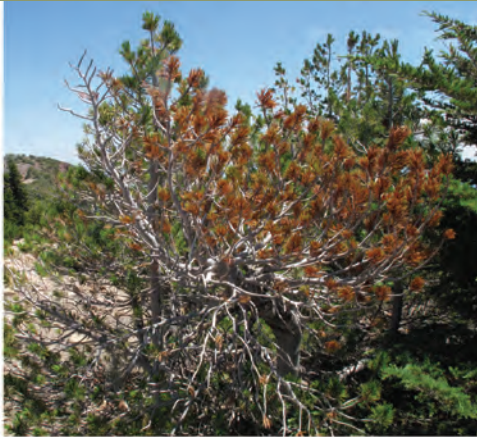
White pine blister rust is rarely seen but symptoms include branch dieback.