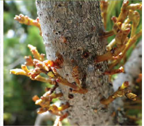
With drought and climate change, mistletoes have more serious impacts.

The forests along the length of the PCT showcase unparalleled conifer diversity – for trail users who are tree aware – and are home to about 10% of the world’s conifer species. However, pines face an uncertain future, and scientists are trying to learn more. You can help and are invited to join an effort to better understand the rapidly changing conditions confronting five-needle pines by contributing your PCT observations.