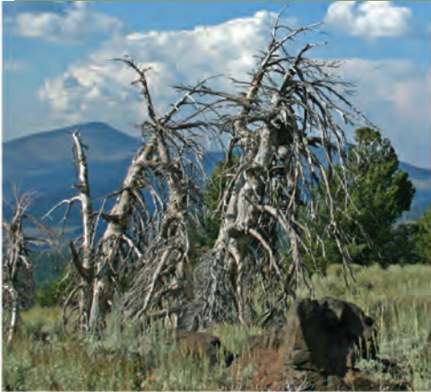
Bark beetles generally kill larger trees in various sized pockets.